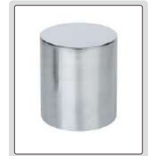
5kg weight block (optional) for ISH-DSD